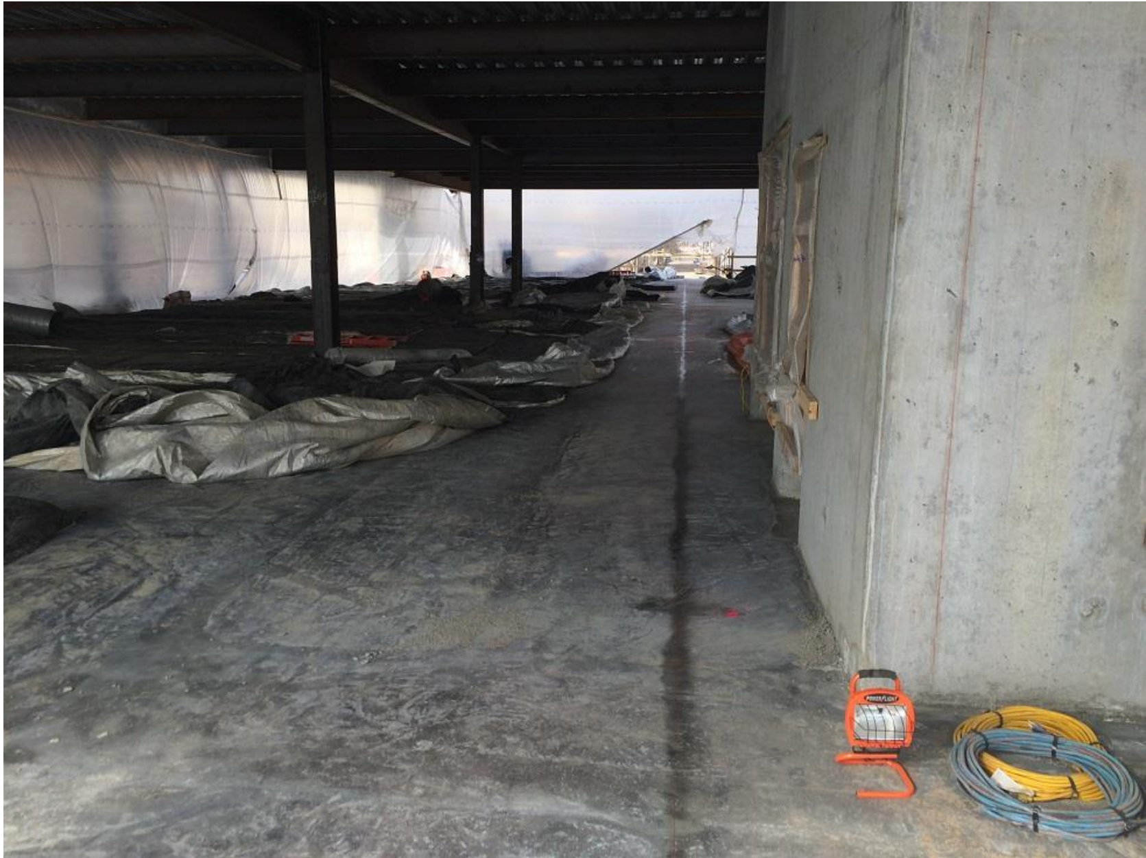
Concrete deck finished seq. 1 2 nd level.