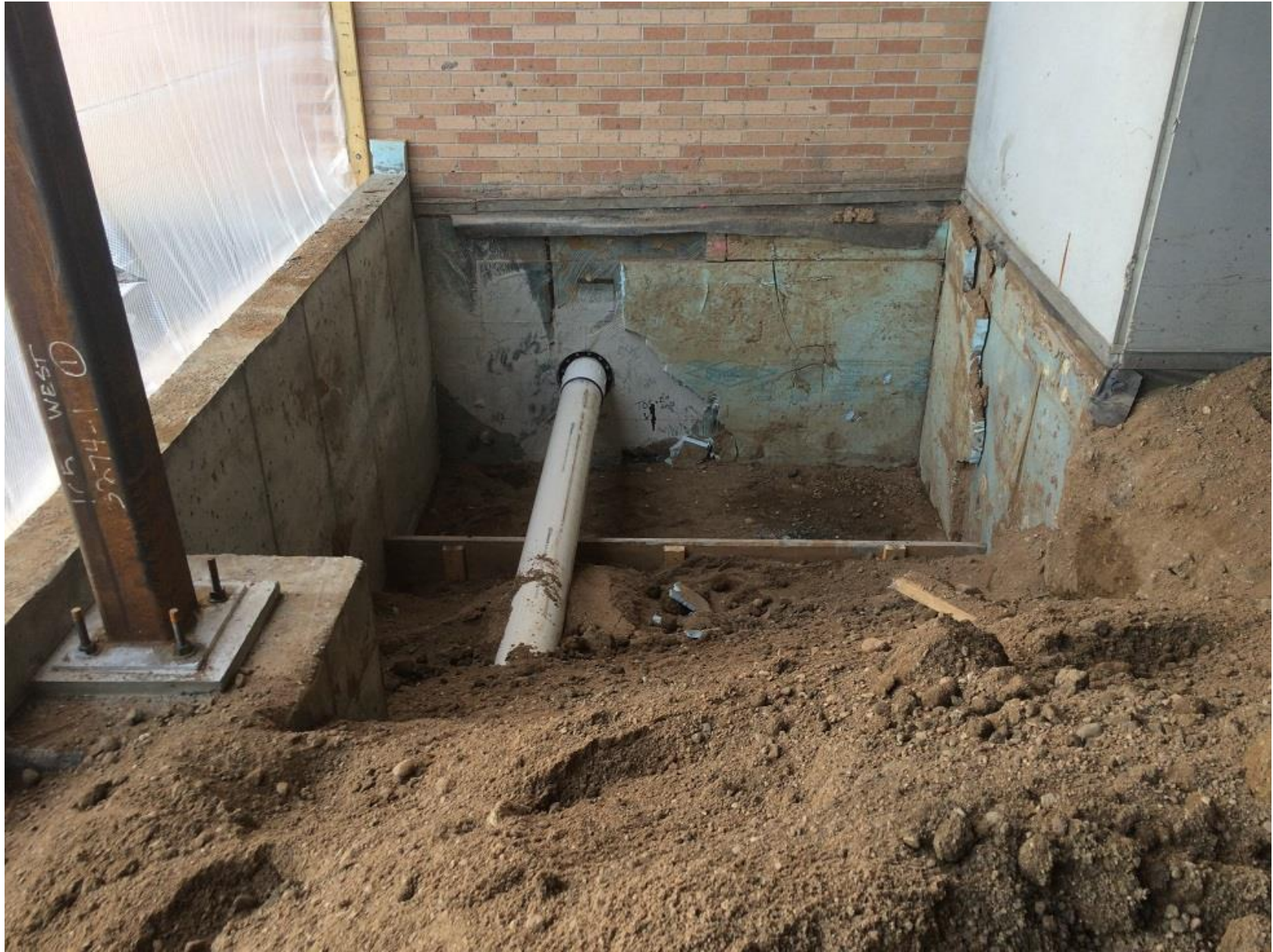
Plumbing tie in to existing.