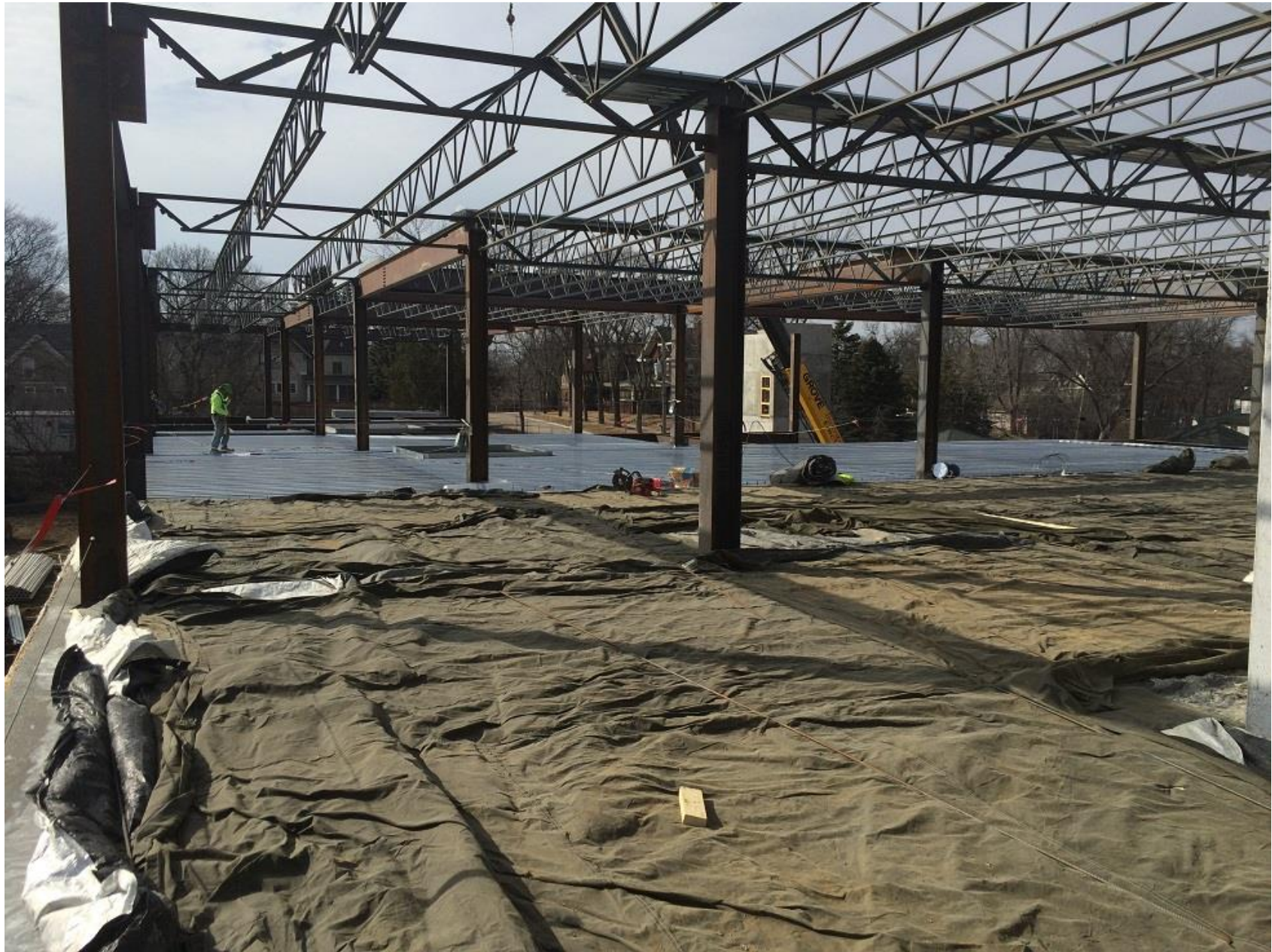
Seq. 2 3 rd level steel decking progress.