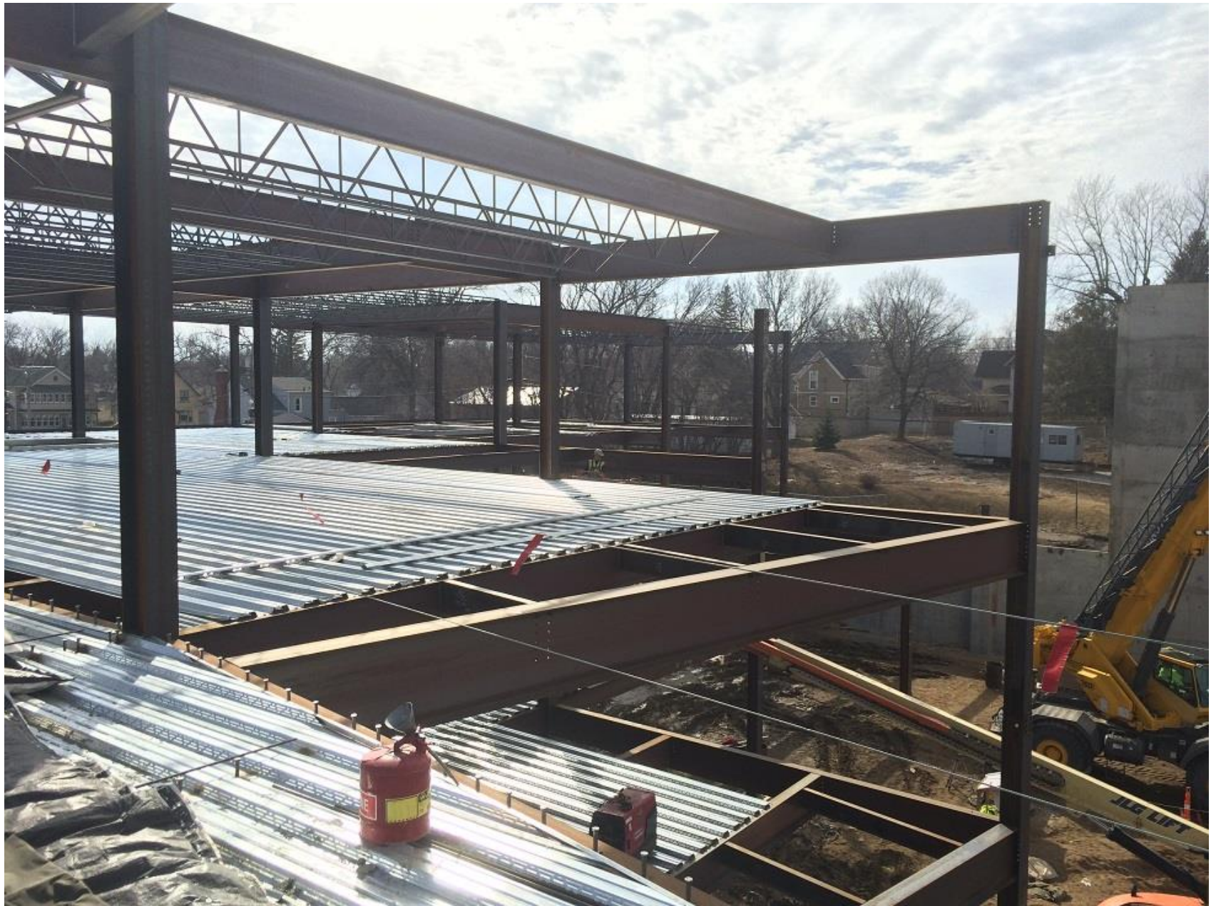
Seq. 2 steel erection overview.