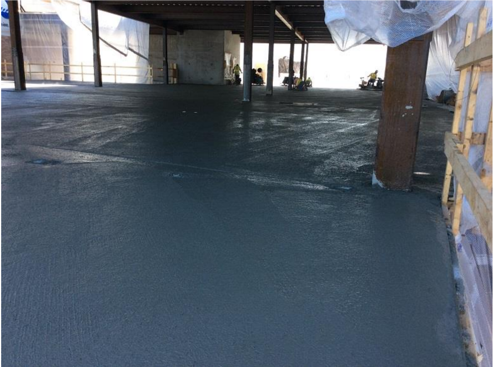
Deck pour complete seq. 1