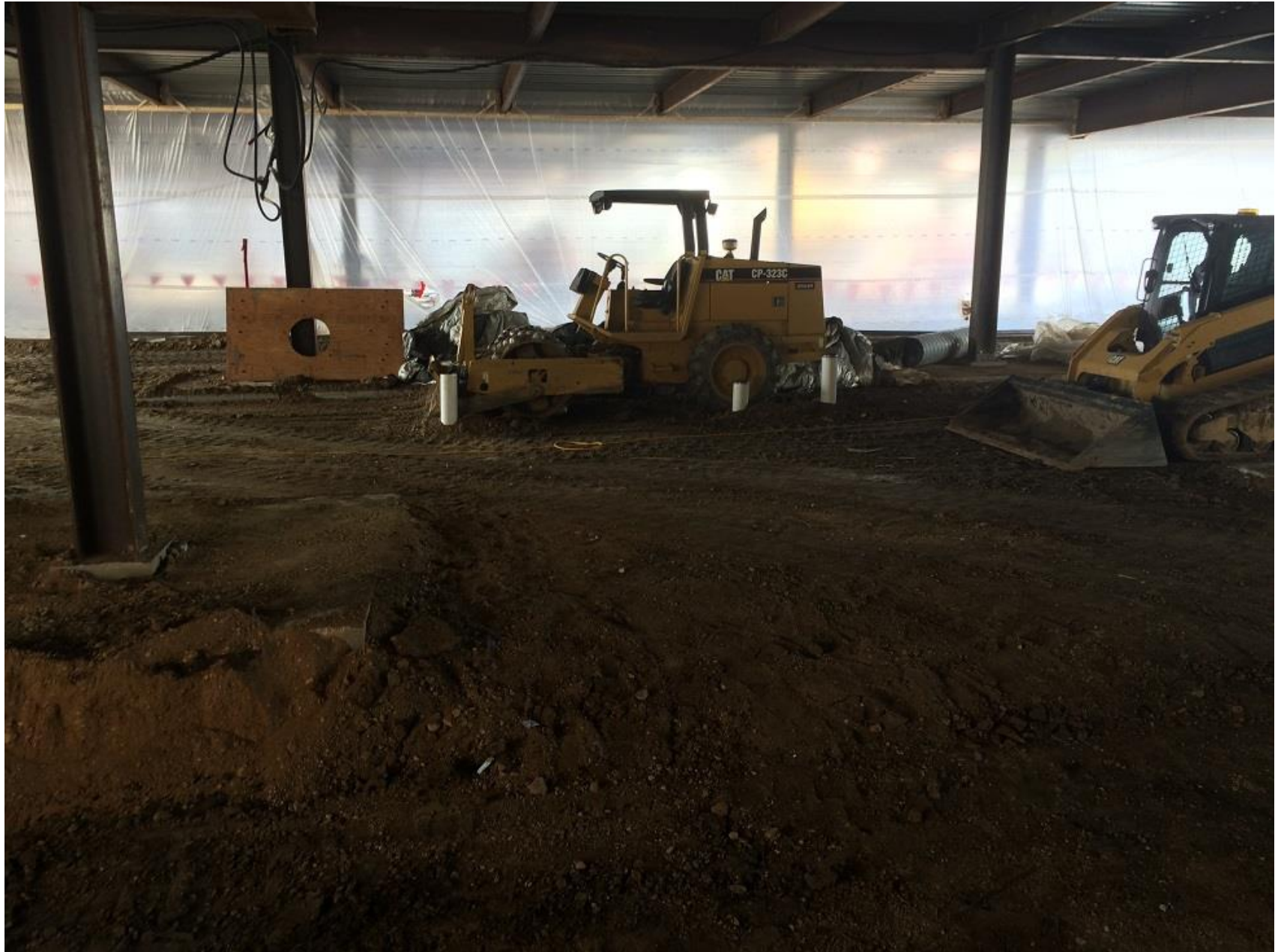
Soil corrections being made in Seq. 1 and prepping for SOG pour.