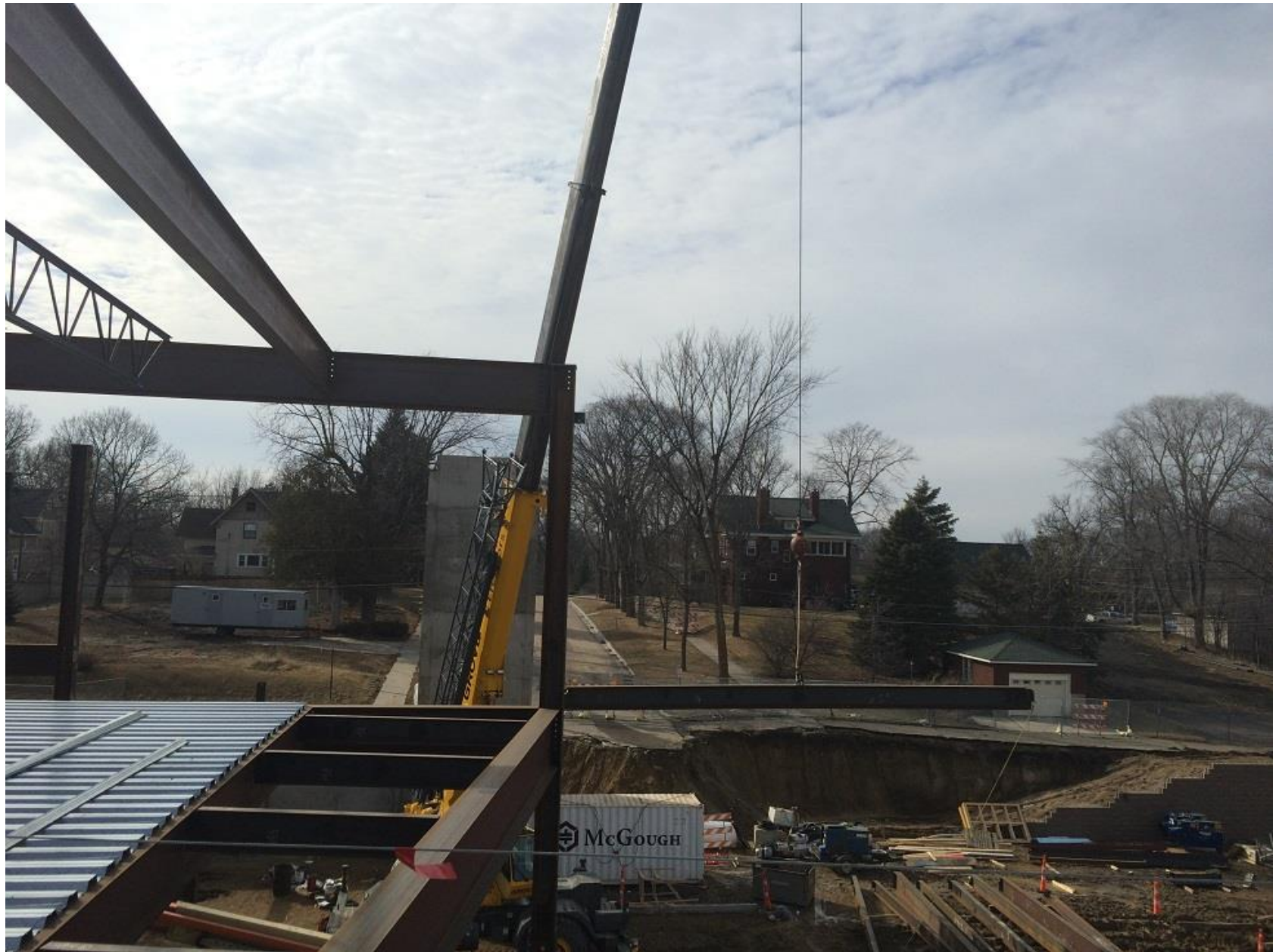
Structural beam being lifted into place.