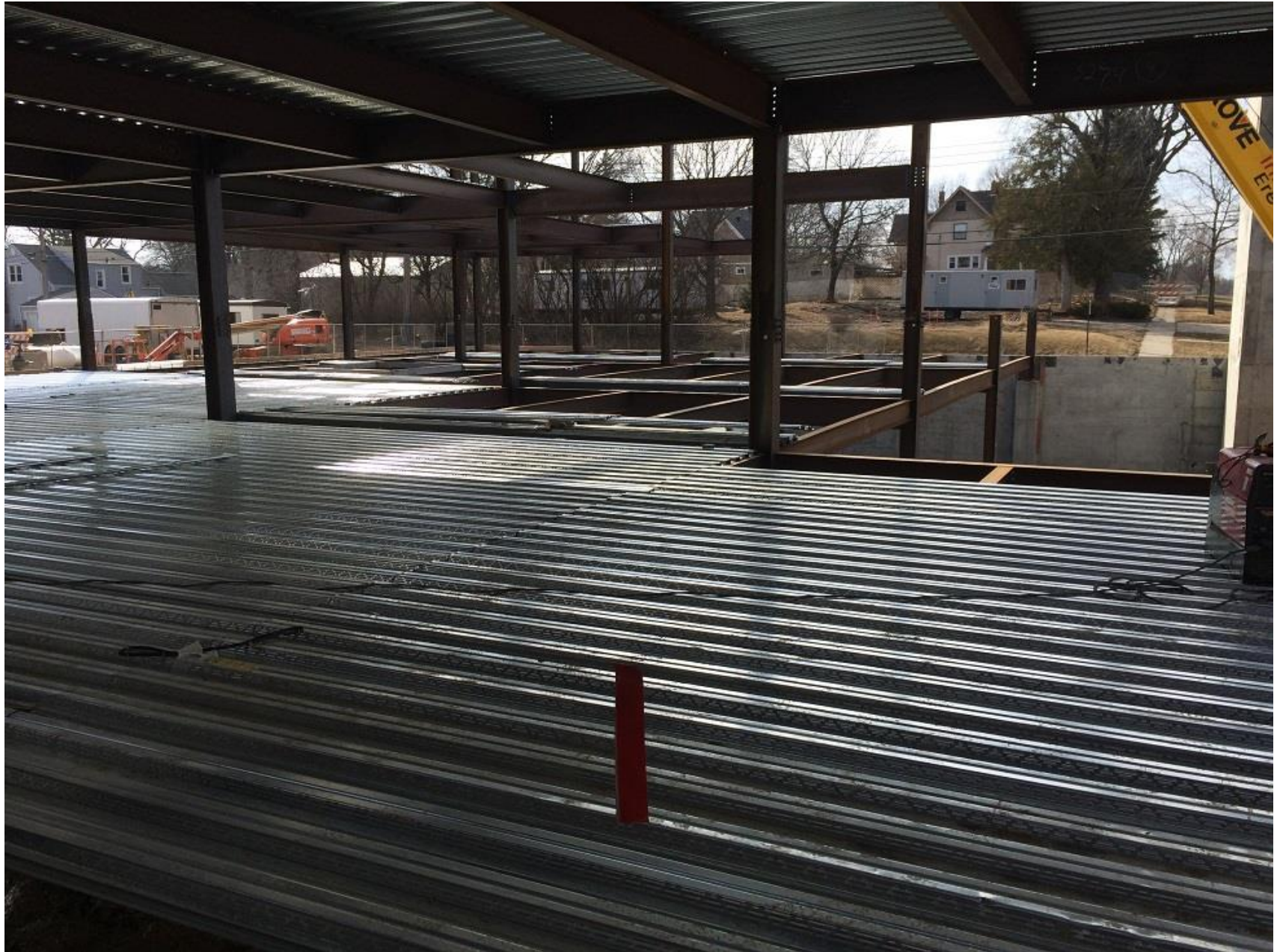
2 nd level seq. 2 steel erection progress.