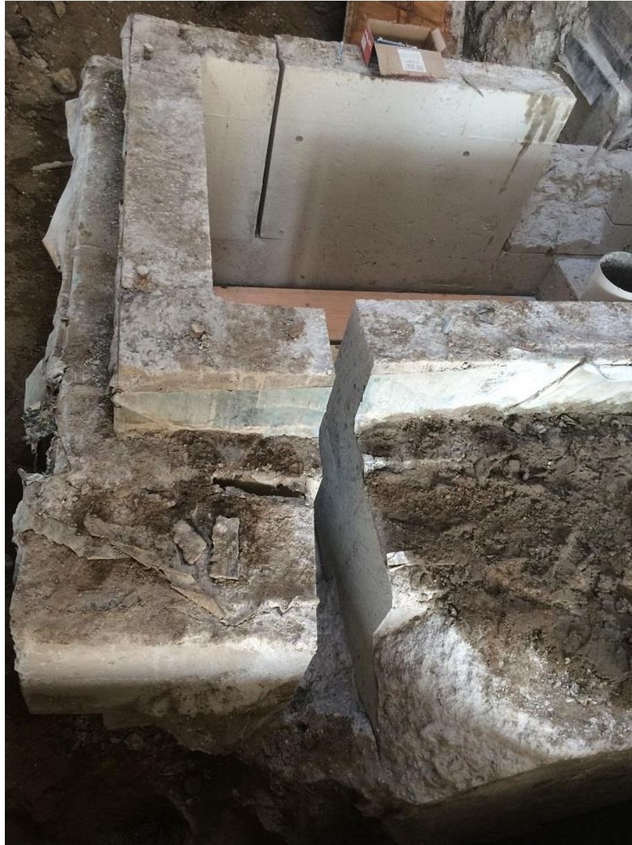
Concrete saw cut to accept grade beam.