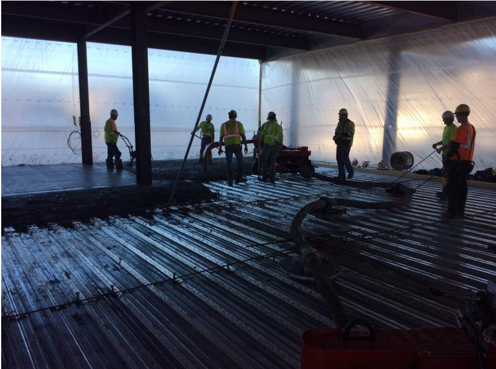
Pouring Deck in seq. 1